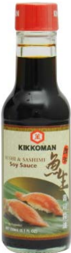
KIKKOMAN Sushi Sashimi Soy Sauce 150mL

This white soy sauce has a distinct umami flavour, different from regular, light soy sauce. With an irresistible salty taste, this product serves as an ideal alternative to fish sauce. Use in dressings and sauces to add deep yet delicate flavours.