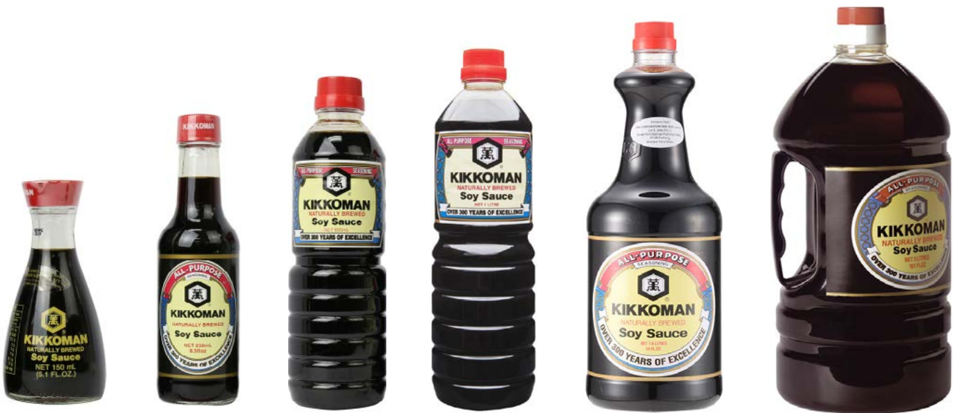
KIKKOMAN Fancy Soy Sauce 150mL / 250mL / 600mL / 1L / 1.6L / 3L

Our soy sauce comes in a variety of different sizes and shapes. These all-purpose soy sauces are ideal for everyday use and can be used to accompany sushi, sashimi and more.