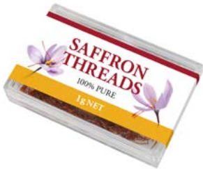
Pushal Saffron Threads 1g