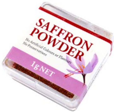
Saffron Powder 1g

HBC boasts the highest quality saffron in Australia and New Zealand based on international standards through laboratory testing. Saffron is considered the most expensive spice in the world, due to the extremely labour-intensive process involved in harvesting these fine threads. This musty, honey-flavoured spice is best used in small quantities, often becoming bitter when overused. Most commonly used in risottos and paellas, this beautiful spice is a staple ingredient for Middle Eastern and European dishes.