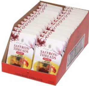
Pure Mancha Saffron Threads on Card 0.5g