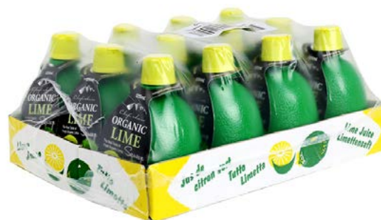
Organic Lime Squeeze BOX 125mL x 12pc