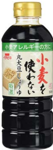
ICHIBIKI Wheat Free Soy Sauce 500mL

A sauce specifically developed for sushi and sashimi. Made from Naturally Brewed Soy Sauce, Sushi & Sashimi Soy Sauce is sweeter and milder than our regular Soy Sauce. The balance of sweetness and saltiness, as well as a special blend of natural ingredients, enhances the flavour of sushi and sashimi.