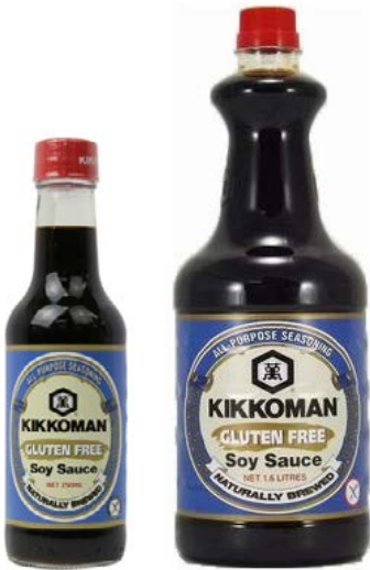
KIKKOMAN Soy Sauce Gluten Free 250mL / 1.6L

Kikkoman's gluten free soy sauce is naturally brewed and consists only of water, rice, salt, and soybeans.