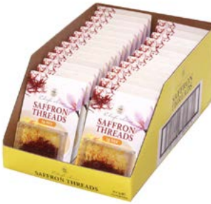
Saffron Threads Box Model 1g