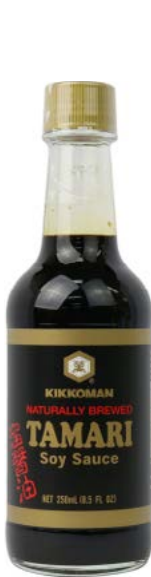
KIKKOMAN Tamari Soy Sauce 250mL

With a slightly stronger flavour than traditional soy sauce, tamari is the ideal variety for use with sashimi and sushi.