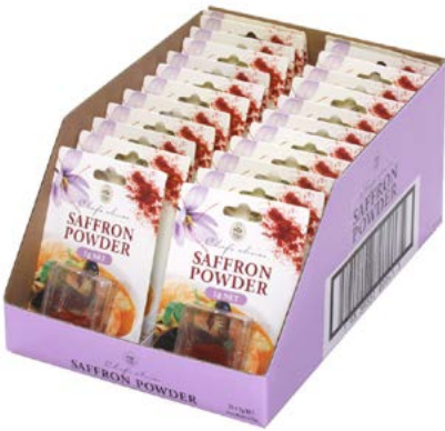
Saffron Powder Box Model 1g