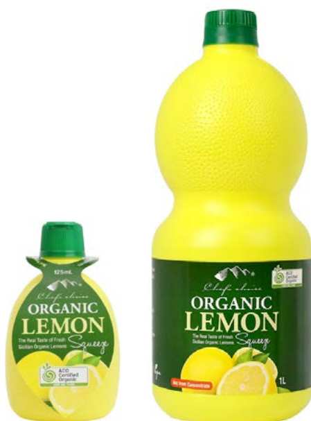
Organic Lemon Squeeze 125mL / 1L

Ready squeezed lemon and lime for all culinary uses. Ideal on salads, seafood, meats, cocktails, sweets and sauces.