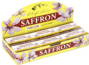
Saffron Threads Display Box 1g

HBC boasts the highest quality saffron in Australia and New Zealand based on international standards through laboratory testing. Saffron is considered the most expensive spice in the world, due to the extremely labour-intensive process involved in harvesting these fine threads. This musty, honey-flavoured spice is best used in small quantities, often becoming bitter when overused. Most commonly used in risottos and paellas, this beautiful spice is a staple ingredient for Middle Eastern and European dishes.