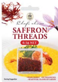
Pure Mancha Saffron Threads on Card 0.5g