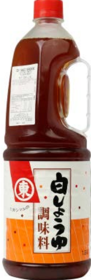
HIGASHIMARU Shiro Shoyu (White Soy Sauce) 1.8L

It is known for its thickness, rich umami, and savory flavor and fragrance. Tamari is recommended for dipping sushi and sashimi, as well as when cooking dishes including teriyaki.