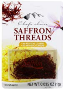
Saffron Threads on Card 1g