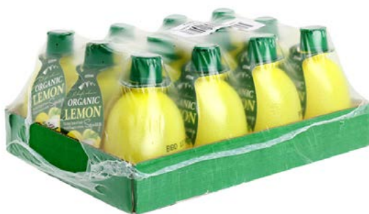
Organic Lemon Squeeze BOX 125mL x 12pc