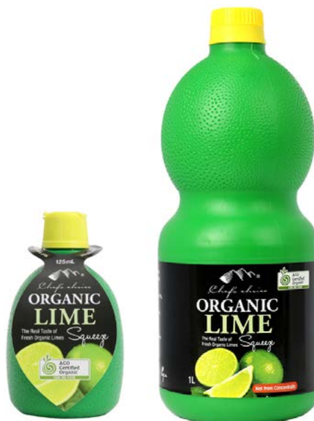
Organic Lime Squeeze 125mL / 1L