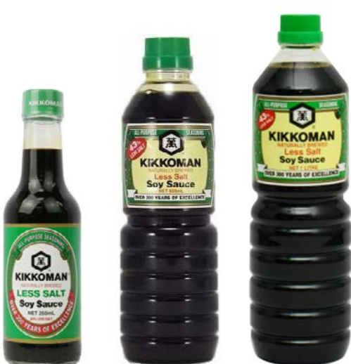
KIKKOMAN Soy Sauce Less Salt 250mL / 600mL / 1L

Kikkoman's gluten free soy sauce is naturally brewed and consists only of water, rice, salt, and soybeans.