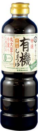
KIKKOMAN Soy Sauce Organic 750mL

This soy sauce is lower in salt than its traditional counterpart, giving it a subtler flavouring.