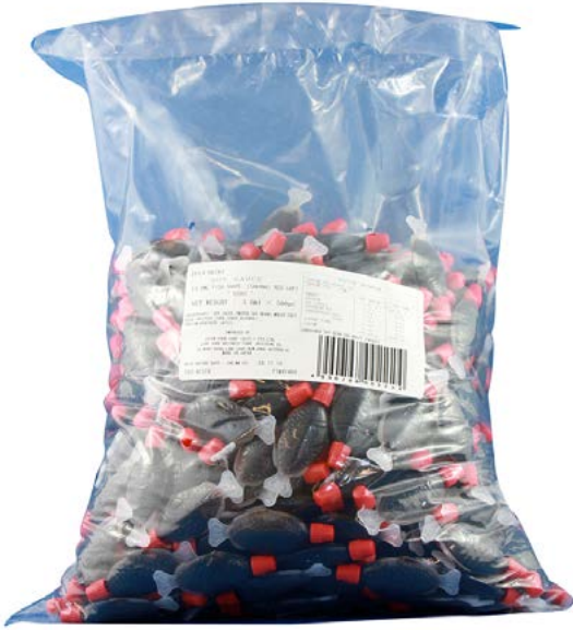
ASAHI Fish Shaped Mini Soy 500PCS/PK

This gluten-free soy sauce is made entirely from genetically-unmodified unprocessed soybeans. Absolutely no wheat is used in this product. Brewed from unprocessed soybeans and salt, this is a "whole soybean soy sauce". Try out the rich umami flavor that is the essence of soybeans, while at the same time enjoying a worry-free soy sauce for those with wheat allergies.