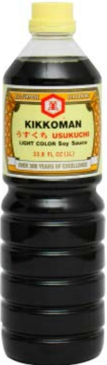
KIKKOMAN Usukuchi Soy Sauce 1L

Naturally brewed from Certified Organic Soy beans, combined with Certified Organic wheat, Certified Organic Salt and water.