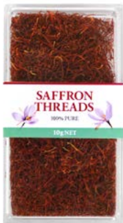
Pushal Saffron Threads 10g