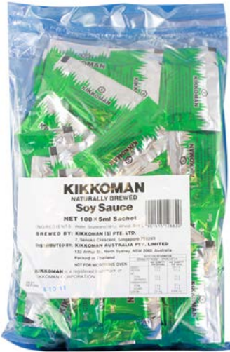
Kikkoman Mini Shoyu 5mL 100PCS / PK