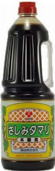
MORITA Tamari Soy Sauce 1.8 L

With a slightly stronger flavour than traditional soy sauce, tamari is the ideal variety for use with sashimi and sushi.