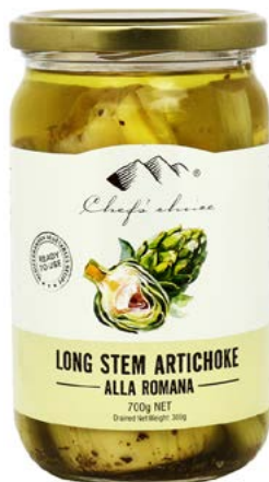
Long Stem Artichoke – Alla Romana – 700g

Chef's Choice All Natural Preserved Lemons are used as a condiment in many Middle Eastern, North African and Moroccan dishes. The liquid and lemon peel can be used for cooking with meat, poultry, seafood, soups, stews, rice or salads. The salty, savoury, pickled taste adds depth into vegan dishes and can be used as a great alternative to anchovy.