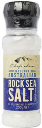
Natural Australian Rock Sea Salt with Grinder 200g / Refill pack 1kg