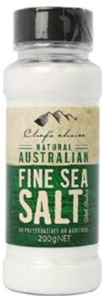
Natural Australian Fine Sea Salt with Shaker 200g

Chef's Choice Natural Australian Premium Sea Salt range is dried and naturally evaporated sea salt from the waters of Australia. Enjoy the fresh flavour of natural sea salt and use it as a replacement for ordinary salt in cooking, baking, or to season dishes before serving.