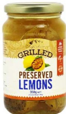
Grilled Preserved Lemons 350g

Chef's Choice Preserved Lemon Paste is an easy and ready to use delicious spread that can be used to enhance the flavour of any seafood, chicken and lamb dish. Using it on any salads or sandwiches will bring it an amazing citrus freshness with a unique flavour. Perfect for tagine and ragouts as well.