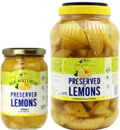
Preserved Lemons 350g

Chef's Choice Artichoke Paste with Preserved Lemon can be used to garnish sandwiches, lasagna or simply be tossed in your favourite pasta. It goes well with grilled chicken or seafood and can be an amazing appetizer on toasted bread.