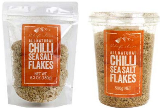
Chilli Sea Salt Flakes 180g / 500g

Chef's Choice All Natural Chilli Sea Salt Flakes will enhance the flavour of your favourite dishes and is ideal for any meat or chicken, fish, salads, potatoes and vegetables.