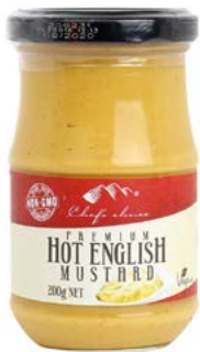
Premium Hot English Mustard 200g

Chef's Choice Premium Mustards can add exceptional flavour and texture to all your favourite foods. It can be used to marinate chicken, fish and pork and add spice to your burgers and wraps. Also excellent in mayonnaise, vinaigrette dressings and creamy sauces.