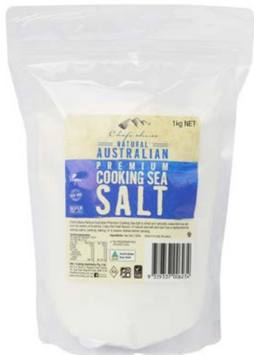
Natural Australian Premium Cooking Sea Salt 1kg