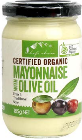
Organic Mayonnaise with Olive Oil French Traditional Style 185g

Chef's Choice Certified Organic Mayonnaise is a classically thick and creamy condiment which is an essential in every home. Our mayonnaise works as a great accompaniment in the preparation of raw vegetables, meat and fish.