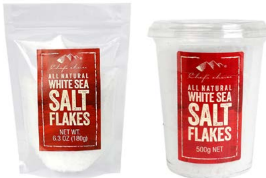
White Sea Salt Flakes 180g / 500g

Chef's Choice All Natural Smoked Sea Salt Flakes have a pleasant smoky taste and is ideal for grilled meat, fish and vegetables dishes.