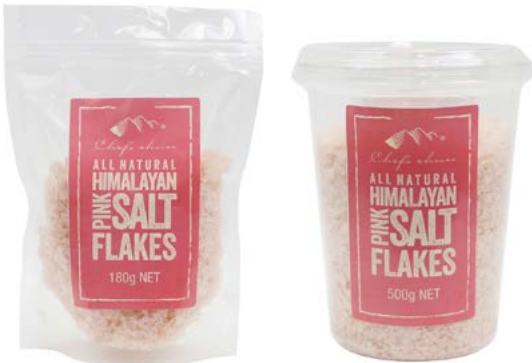
Himalayan Pink Salt Flakes 180g / 500g

Chef's Choice All Natural Chilli Sea Salt Flakes are natural pink pyramid-shaped crystals loaded with flavour. This delicate gourmet flake provides a delicate crunch making it ideal for seasoning, cooking, roasting, baking or as a garnish. Perfect for all types of seafood as well as meats, salads and vegetables.