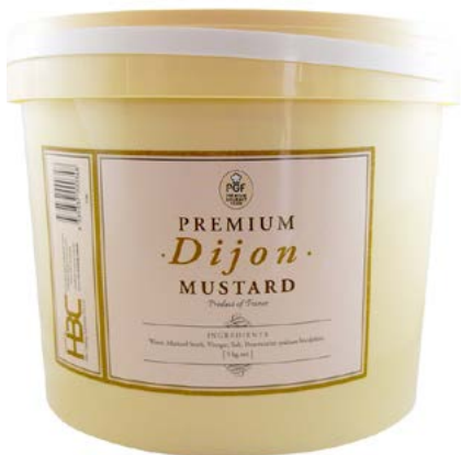
Premium French Dijon Mustard 200g / 1.6kg / 5kg