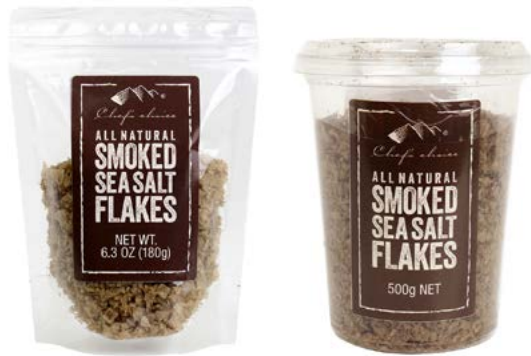
Smoked Sea Salt Flakes 180g / 500g

Chef's Choice All Natural Chilli Sea Salt Flakes will enhance the flavour of your favourite dishes and is ideal for any meat or chicken, fish, salads, potatoes and vegetables.