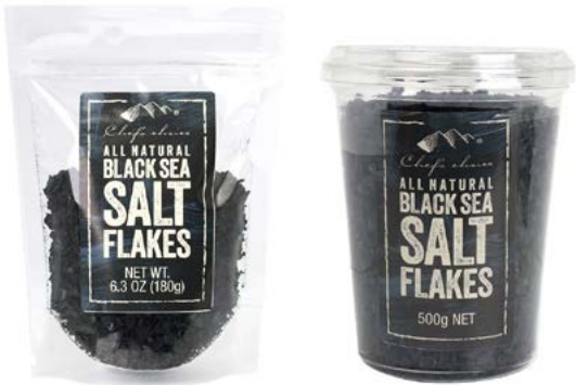
Black Sea Salt 180g / 500g

Chef's Choice White Sea Salt Flakes are white, natural pyramid-shaped crystals harvested from the Mediterranean sea. This delicate gourmet flake provides a delicate crunch making it ideal for seasoning, cooking, roasting, baking or as a garnish. Perfect for all types of seafood as well as meats, salads and vegetables.