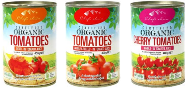
Organic Diced Tomatoes 400g

Originating from an authentic Italian recipe, Chef's Choice Organic Napoletana Pasta Sauce takes the stress and time out of cooking a 5-star meal. This simple yet tantalizing tomato-based sauce with a hint of Italian chilli pepper is now made readily available for your convenience to enjoy in just a few minutes.