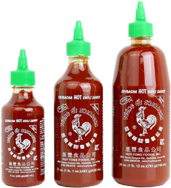
Sriracha Hot Chili Sauce 266mL

Created from sun ripened chilies into a smooth paste we have captured its flavor in a convenient squeeze bottle that is easy to use.