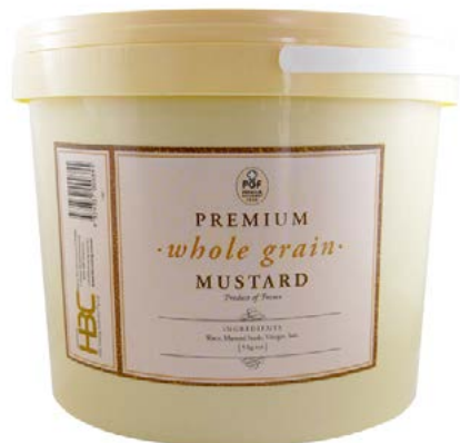
Premium French Whole Grain Mustard 200g / 1.6kg / 5kg