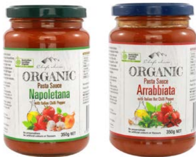
Organic Pasta Sauce Napoletana w/ Italian Chilli Pepper 350g

Chef's Choice Certified Organic Passata is made from the highest quality organic tomatoes, handpicked and ripened under the beautiful Italian sun. The tomatoes are skinned, crushed and sieved leaving only the most succulent parts of the tomato. Passata is the key ingredient in many pasta sauces, and also makes an excellent base for pizzas, curries and soups.