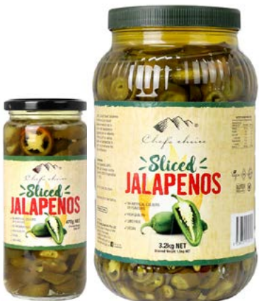
Sliced Jalapenos 470g / 3.2kg

Chef's Choice Sliced Jalapenos are delicious pre-sliced jalapenos ready to eat or use for your convenience. Jalapenos can be added to anything such as nachos, salads and sandwiches to spice it up or enhance the taste and flavours.