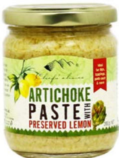
Artichoke Paste with Preserved Lemon 200g

Chef's Choice Sliced Jalapenos are delicious pre-sliced jalapenos ready to eat or use for your convenience. Jalapenos can be added to anything such as nachos, salads and sandwiches to spice it up or enhance the taste and flavours.