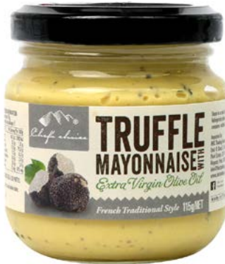
Truffle Mayonnaise with Extra Virgin Olive Oil 115g

Chef's Choice Certified Organic Aioli Sauce is a simple yet flavoursome blend of organically produced ingredients. With a delicious garlic