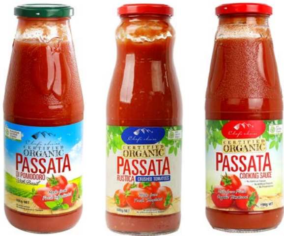
Organic Passata Di Pomodoro with Basil 690g