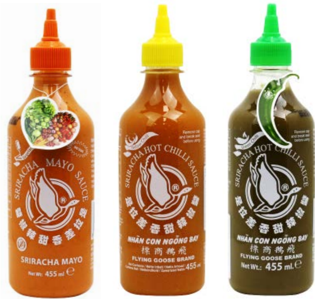
Sriracha Mayo Chilli Sauce 455mL