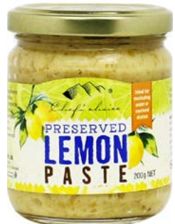
Preserved Lemon Paste 200g

Tunisian long stem artichokes prepared in the Italian "crudo tradition" and are firm and fresh tasting. Cut them in quarter and serve them as is which a drop of extra virgin olive oil, or add them to your favourite salad or pizza.