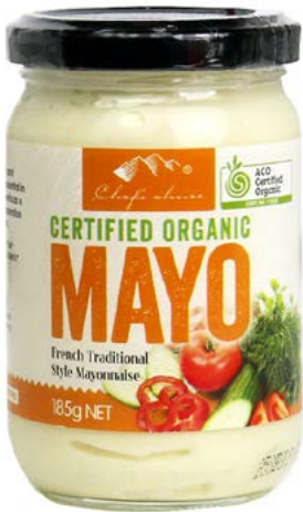
Organic Mayonnaise French Traditional Style 185g

Chef's Choice Certified Organic Mayonnaise is a classically thick and creamy condiment which is an essential in every home. Our mayonnaise works as a great accompaniment in the preparation of raw vegetables, meat and fish.